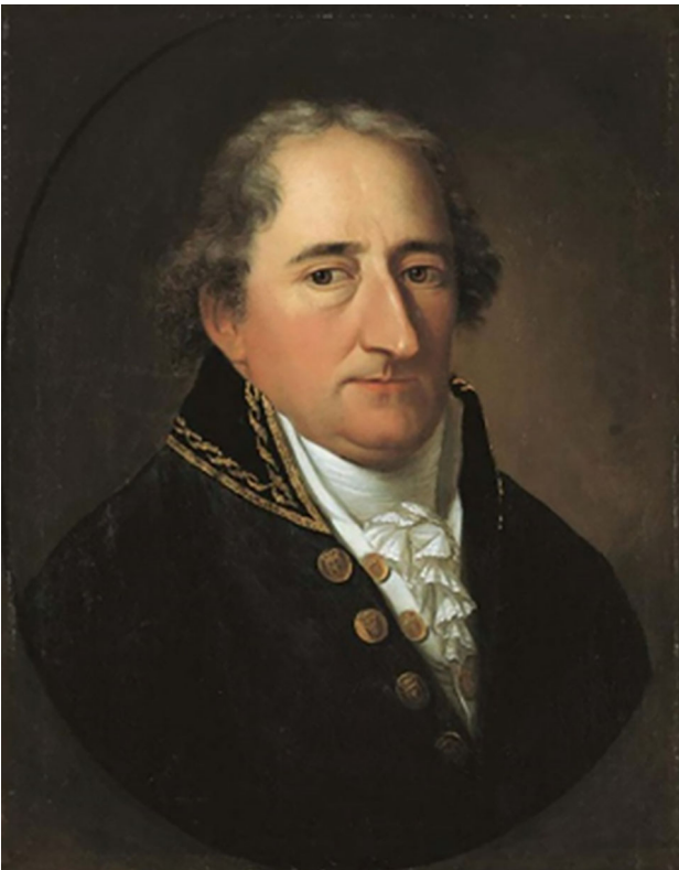
Fig. 3: Karl Freiherr vom Stein, painting by Johann Christoph Rincklake, 1804

become head of a new department of education ("Sektion des Kultus und des öffentlichen Unterrichts").