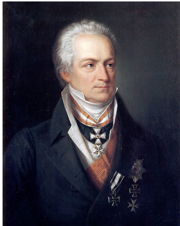
Fig. 2: Karl August von Hardenberg, painting by Friedrich Georg Weitsch, after 1822

müßig zu sein und nichts für das bedrängte Vaterland tun zu können [7].