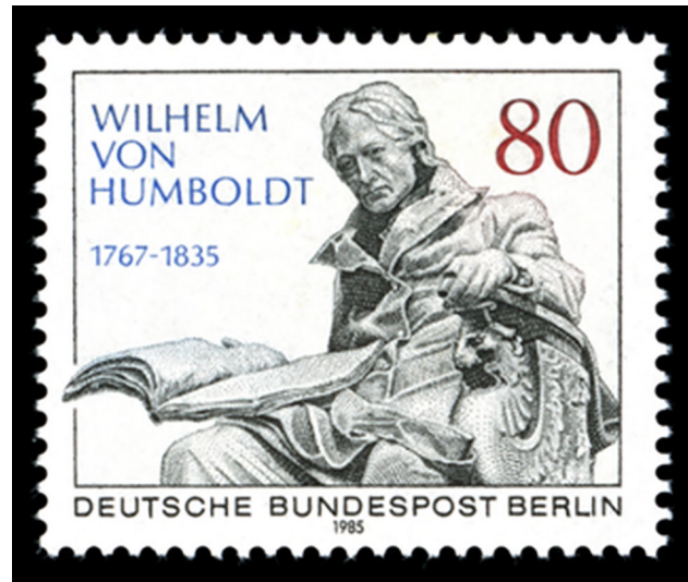
Fig. 1: Wilhelm von Humboldt